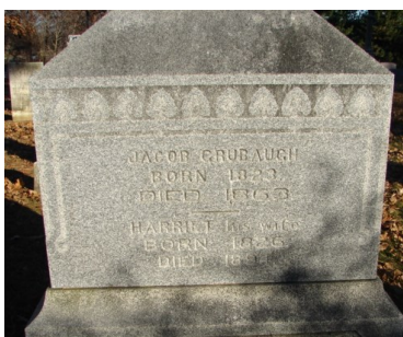
Cenotaph at Union Home Cemetery FindAGrave Memorial #18159464