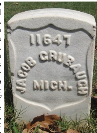
FindAGrave Pic Memorial #55591154